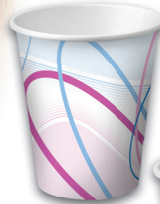
5 oz. Disposable Paper Cups Reorder No. 4336